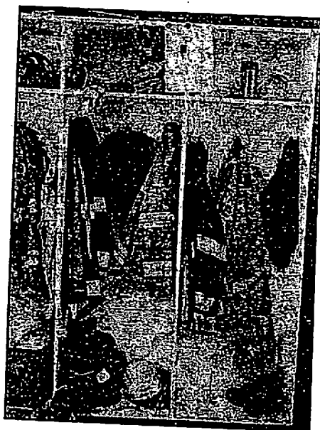
A view of the firefighters' cubbies.